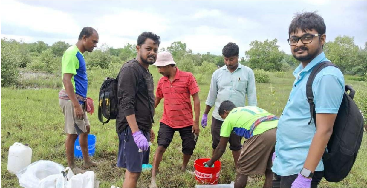
PhD students adding growth promoting bacterial consortia in Mangrove restoration sites