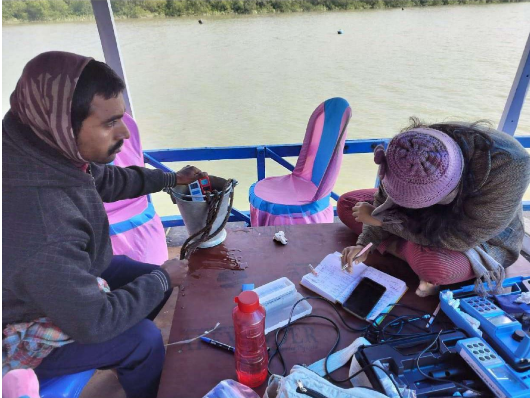
PhD student recording the in-situ water criteria measurements on boat in Indian Sundarbans estuary